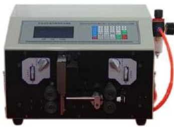
Wire Stripping Machine

All the machinery and technology used at Concord Industries are sourced from leading machine manufacturers with highest level of certifications and latest European technology. This helps us in ensuring the quality and satisfaction for our customers. Few of our machinery used in plug moulding process are as follows -