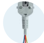
For Plug Moulding