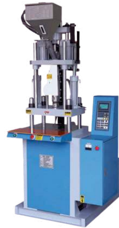
Injection Moulding Machine