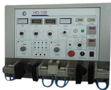
Multiple Plug Testing Machine